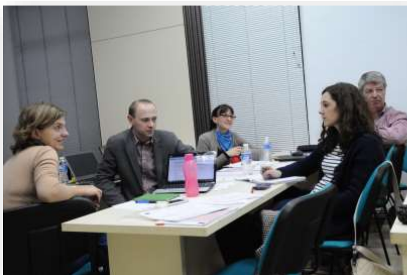
Effective discussions amongst partners