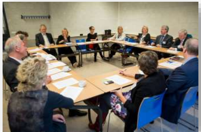
Meeting of the national network representatives

The contacts that we have at the moment as result of the surveys we have conducted in 2015, are 'paying themselves out'. Some of the municipalities we have used for the O2 survey to learn more about the structure they are using for helping people at risk for poverty and social exclusion, are showing interest in hosting the final event of TAP.