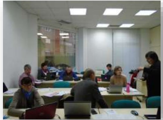
Feedback discussions on the entrepreneurship training curriculum (O3)

We learnt from the report Poverty and social exclusion in selected European countries (Szczygieł, 2015) that people in or at risk of poverty and social exclusion may consider it impossible or irrelevant to take any action to improve their financial situation. This report concluded that the people in or at risk of poverty whom we engaged with are used to their situation and show limited willingness to change it. Rather, they resort to such coping strategies as limiting their current needs, using institutional aid and taking loans. The solution involving additional work was indicated by merely a quarter of the respondents. Clearly, their employment prospects are limited not only by personal considerations, but also by socio-economic conditions. The respondents also pointed to the shortage of entrepreneurial predispositions.